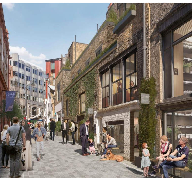
Left: Extent of South Molton Street Project. Right: Indicative CGI's of the South Molton Lane