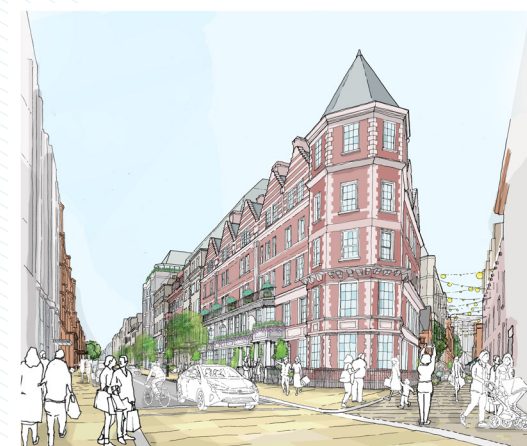
Brook Street looking west