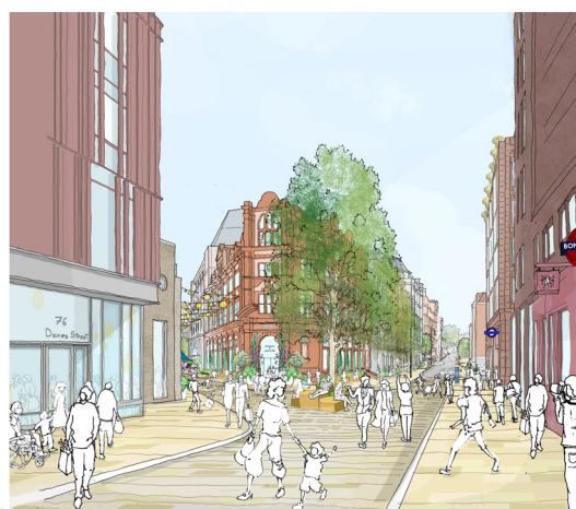
Arrival from Oxford Street