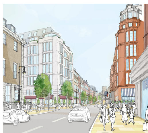
Brook Street looking east