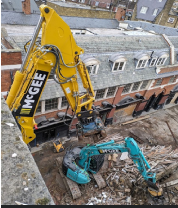
The long arm excavator carrying out demolition work.

We will make every effort to minimise noise, vibration, and dust during the construction works. To achieve this, we have set up NVD monitoring equipment at sensitive receptor locations around the site. The monitoring will ensure that the work complies with the agreed NVD levels outlined in the Westminster Council Code of Construction Practice 2022 and statutory guidelines.