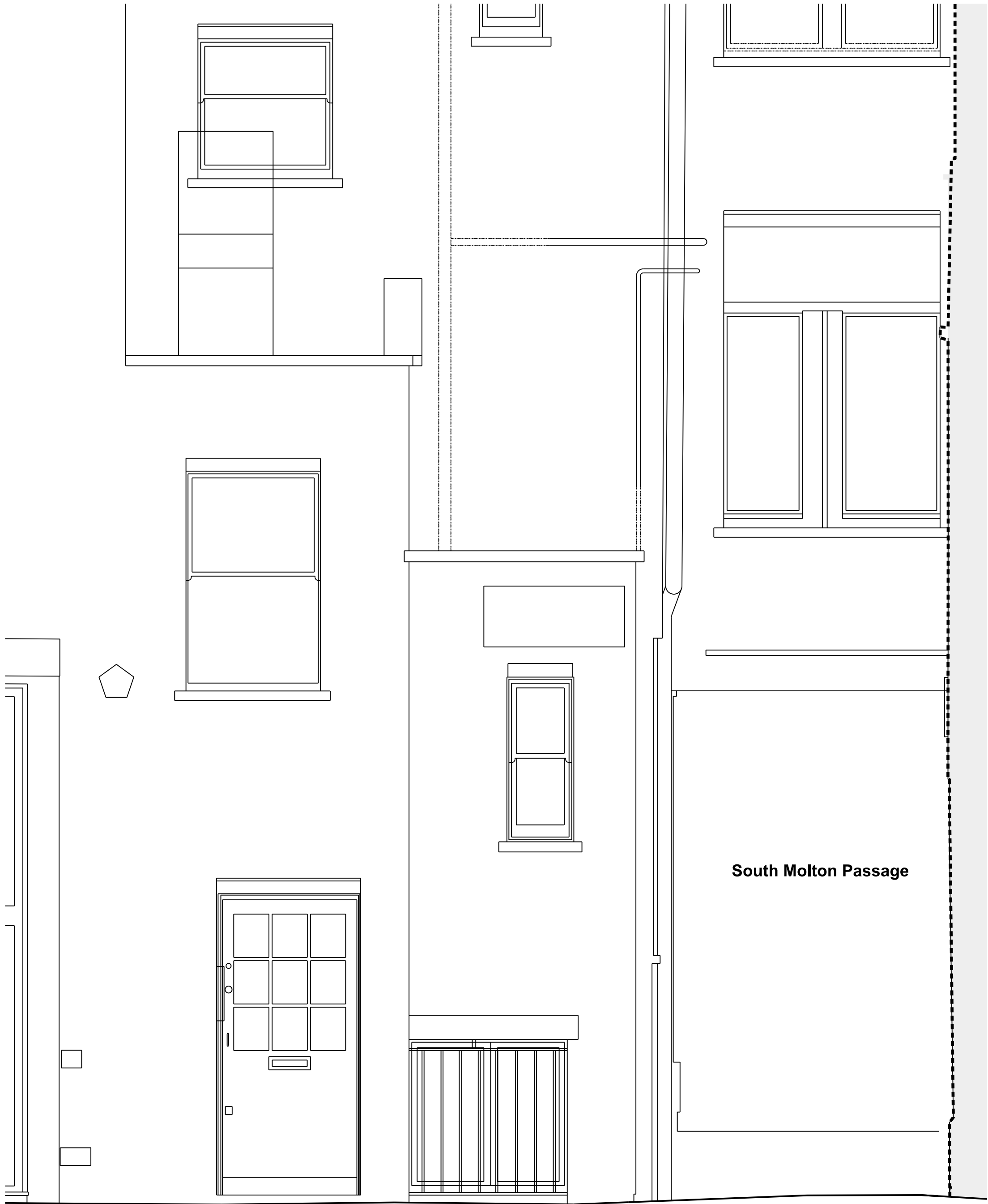
23 South Molton Lane