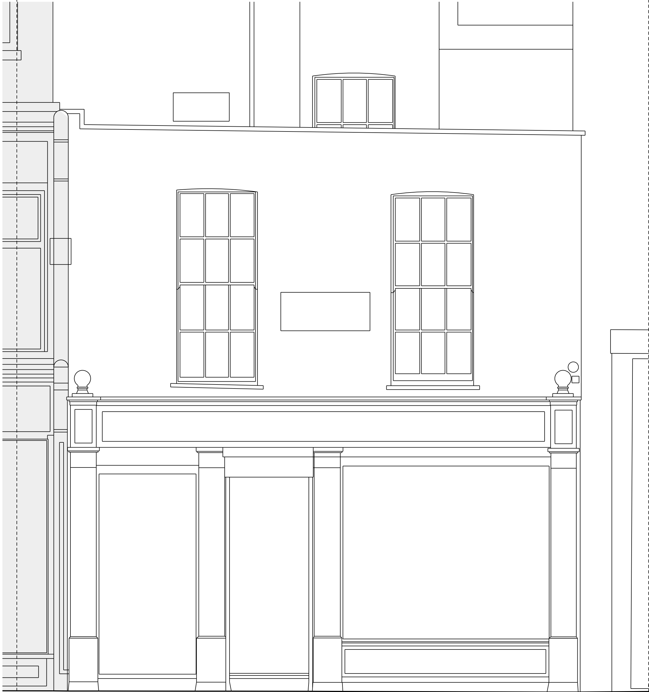
25 South Molton Lane

Drawing applicable to Listed Building Consent application for No. 24-25 South Molton Street