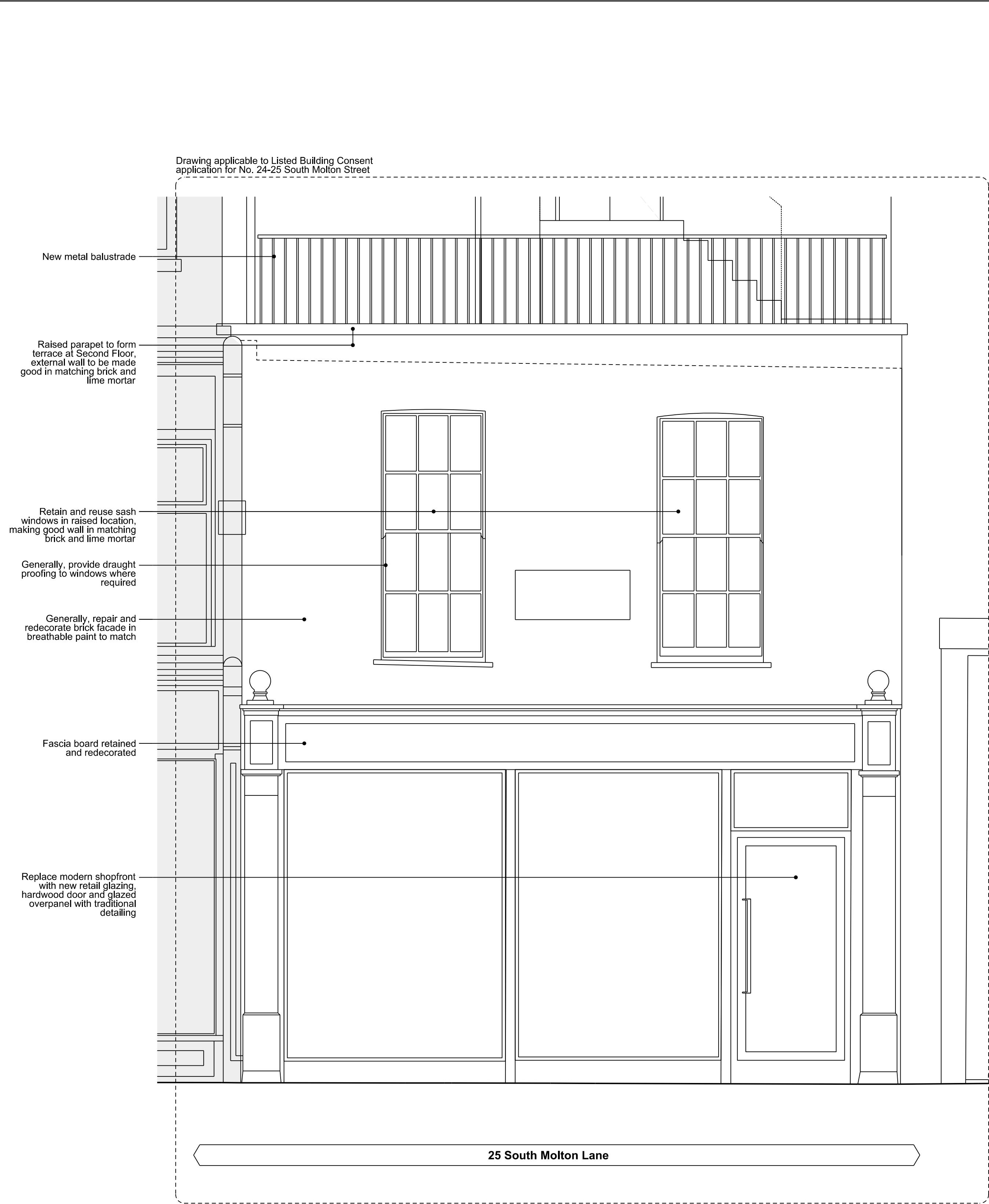
1 Proposed Elevation - 25 South Molton Lane 2312 1:25